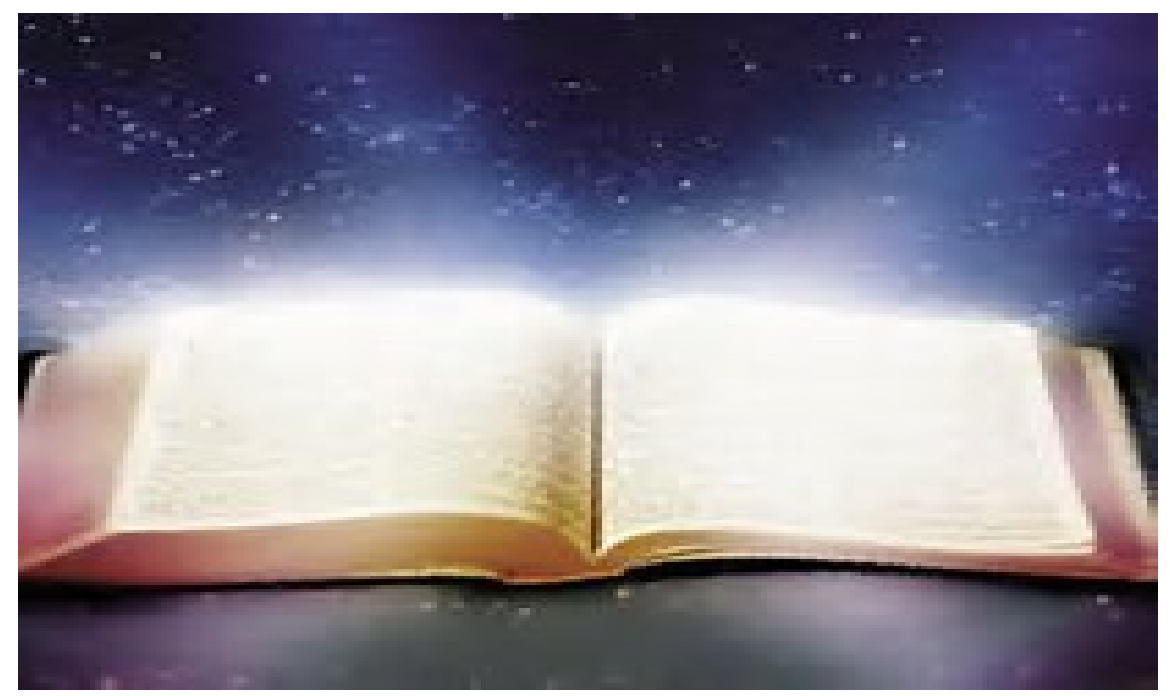
REPENT AND ASK FOR FORGIVENESS AND ASK JESUS TO BE YOUR PERSONAL SAVIOR

The Living Bible (WHICH I DO NOT RECOMMEND) paraphrases these two verses as follows: "But the Holy Spirit tells us clearly that in the last times some in the church will turn away from Christ and become eager followers of teachers with devil-inspired ideas. These teachers will tell lies with straight faces and do it so often that their consciences will not even bother them." The end result of this deception is that many people's faith is completely destroyed. They depart from the truth and follow a way that may seem to be right in terms of human rationalizing but its end is the way of death (Prov. 16:25).