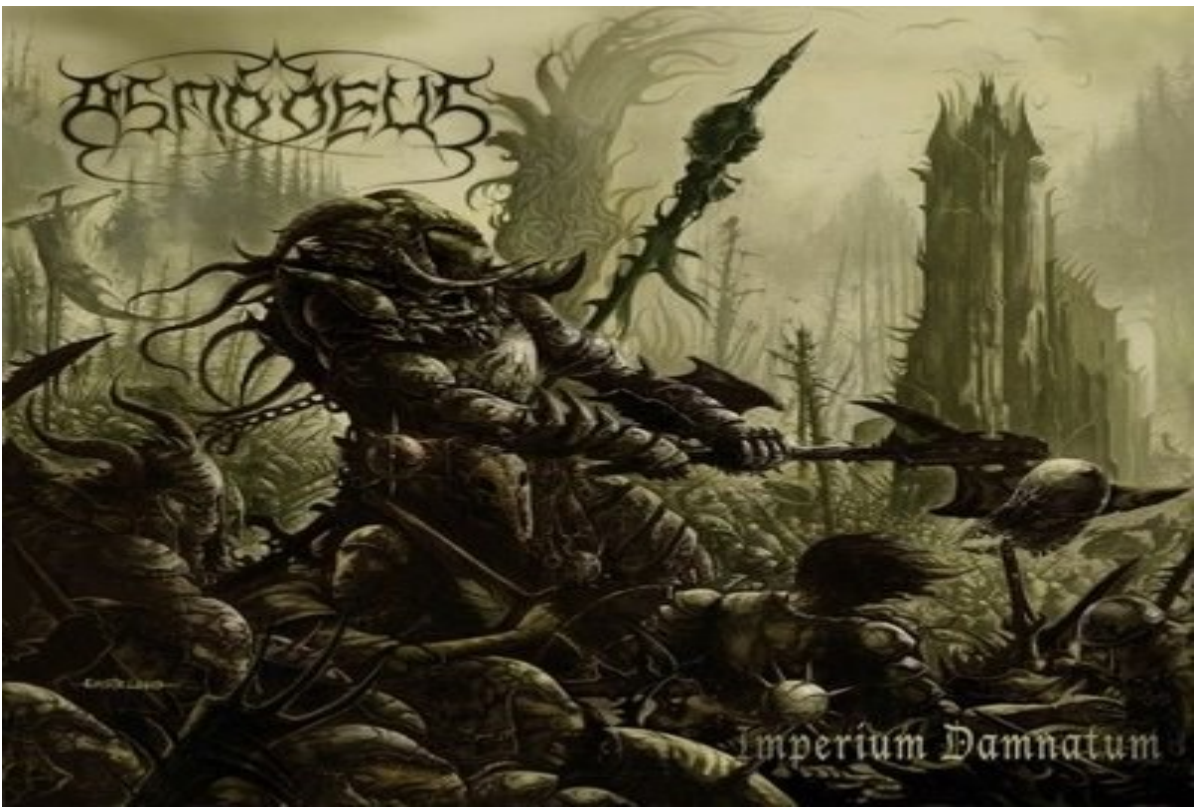
ASMODEUS SPIRIT OF THE BEAST

Mysticism: Strange techniques from the Eastern religions are often used to establish contact with the supernatural world and also to experience spiritual enlightening.