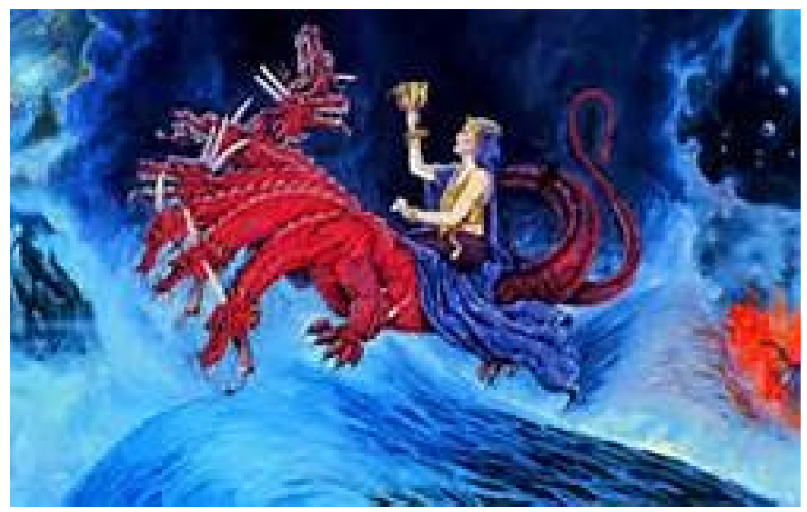
THE WOMAN RIDES THE BEAST

(Rev. 17:3)," So he carried me away in the spirit into the wilderness: and I saw a woman sit upon a scarlet coloured beast, full of names of blasphemy, having seven heads and ten horns. 4 And the woman was arrayed in purple and scarlet colour, and decked with gold and precious stones and pearls, having a golden cup in her hand full of abominations and filthiness of her fornication: 5 And upon her forehead was a name written, Mystery, Babylon The Great, The Mother Of Harlots And Abominations Of The Earth. 6 And I saw the woman drunken with the blood of the saints, and with the blood of the martyrs of Jesus: and when I saw her, I wondered with great admiration. 7 And the angel said unto me, wherefore didst thou marvel? I will tell thee the mystery of the woman, and of the beast that carrieth her, which hath the seven heads and ten horns. 8 The beast that thou sawest was, and is not; and shall ascend out of the bottomless pit, and go into perdition: and they that dwell on the earth shall wonder, whose names were not written in the book of life from the foundation of the world, when they behold the beast that was, and is not, and yet is. 9 And here is the mind which hath wisdom. The seven heads are seven mountains, on which the woman sitteth."